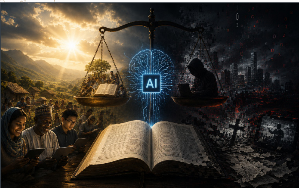
ChatGPT-generated image: Benefits and Risks of AI & Bible Translation