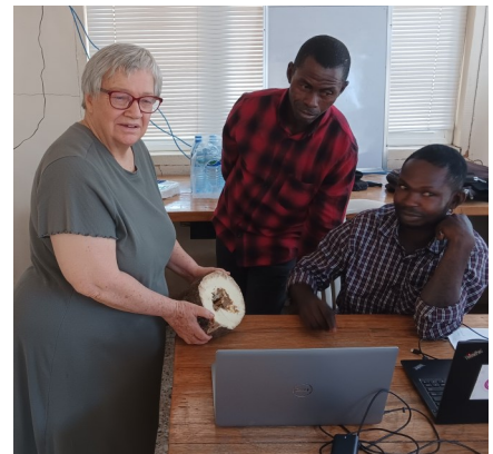
A “foolish” yam