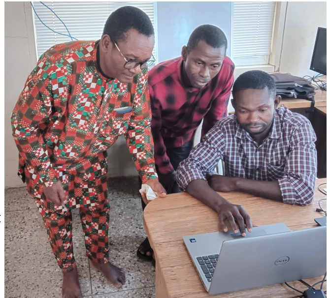
The Kukele team at work

2025 ended like a whirlwind. Teaching an extra class (New Testament Key Terms) as well as weeks of sessions with the Gokana, Kukele, and Yala translation teams provided a nice way to finish the year. Each group is moving forward. With the Gokana team we went through most of the book of Leviticus and with the Kukele team we went through most of the book of Numbers. The Yala team has come up with a plan to have their entire Bible ready to enter the typesetting process by the end of 2026. We got a good start on that plan during the couple of weeks we met together.