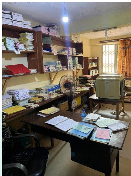
Here is my desk and office at the TISLL office, surrounded by books! The room also houses the printer they use when printing materials.

Please pray for clarity as I continue to ask questions to establish the scope and sequence of the goals for the literacy programs. Pray that God would continue to bless these literacy classes that help people read God's Word in their own language!