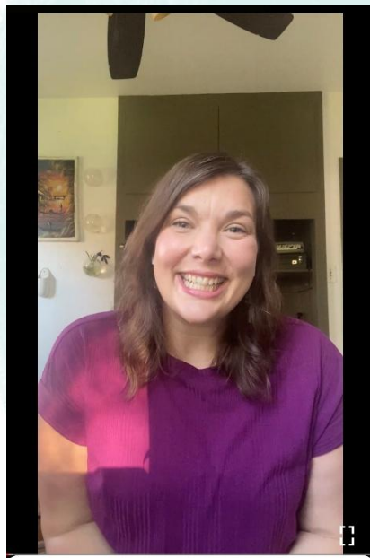
Trinity Mission Festival 2025