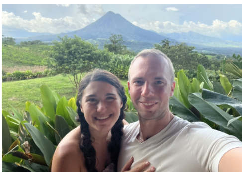
A volcano in Costa Rica, and a sloth we found crossing the road