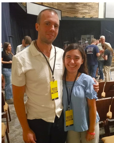
Serving on the prayer team at the conference where we met

and delivered of evil spirits of the occult, anger and abandonment. Getting God's word to people is important because it lets them know there is freedom from darkness. "But you are a chosen people, a royal priesthood, a holy nation, God's special possession, that you may declare the praises of him who called you out of darkness into his wonderful light." (1 Pet 2:9 NIV). When people know God's word in their heart