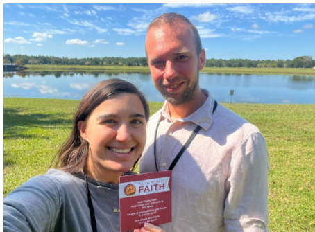
Outside the Wycliffe office in Florida