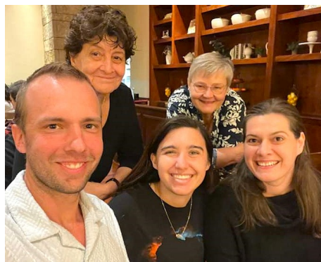
Meeting with Madagascar colleagues

We took a road trip to Dallas to meet up with the project leader and Bible translation consultants for Together in Bible Translation (TiBT) in Madagascar. They were in the USA for just a week, so it was a huge blessing from God that we got to cross paths with them.