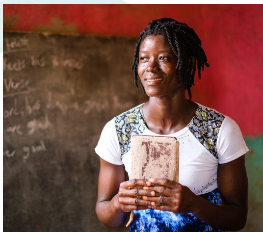
A well-loved Komba New Testament