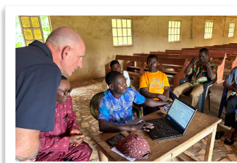
Kukele Project Explanation