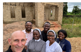
Brothers & Sisters In Christ