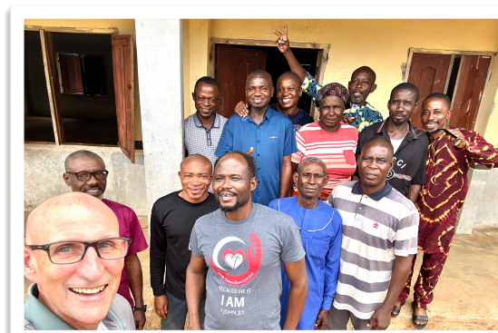
Yala Project Partners Outside Their Meeting Area