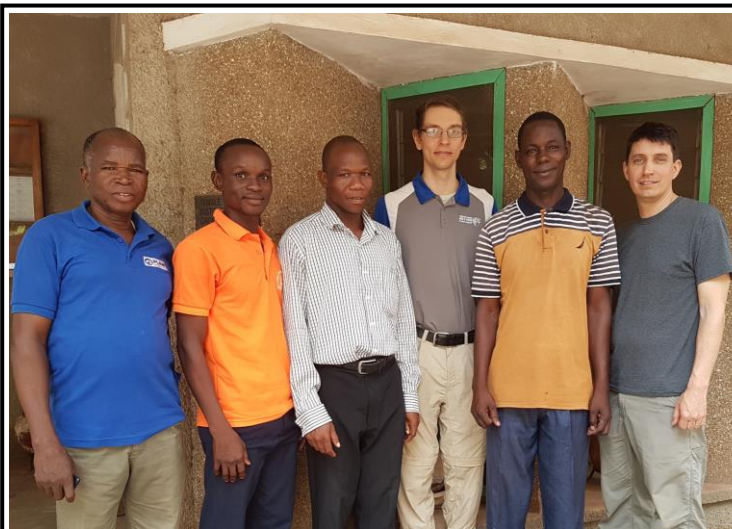
Komba Old Testament Translation Team

is finally printed and on its way to Ghana. Pray that it arrives quickly and safely, so the entire Bible can soon replace the well-used Komba New Testaments. May you be inspired by this testimony to actively pray for the numerous people groups that still do not have a single word of God in their heart language. If you cannot go or financially support Bible translation , pray for and encourage others to do so, as this is a critical work in bringing the lost into the Kingdom .