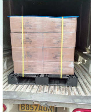
Delivery in Botswana

Praise God that the Khwe will soon have access to God's Word in their heart language!