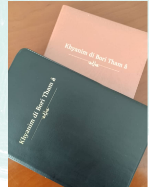
Khwedam 'panoramic' Bible