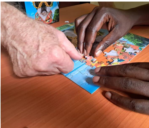
"Five fingers, each doing its work"

The Kerewe translation team recently took on a fun puzzle competition, racing to complete the fastest. One goal was to reinforce the value of teamwork. When every person does their part, the whole picture quickly comes together. TEAM = Together Everyone Achieves More.