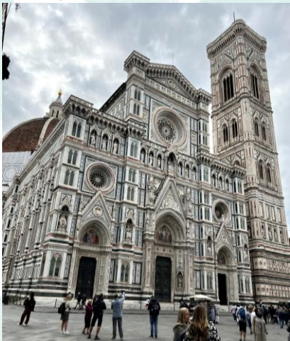
The Cathedral of Santa Maria del Fiore (Florence)

Alongside the translation work, I completed my consultant-in-training workshops online and in person, in Kenya (for the Africa area CITs), and in Italy (for all regions). It was great!