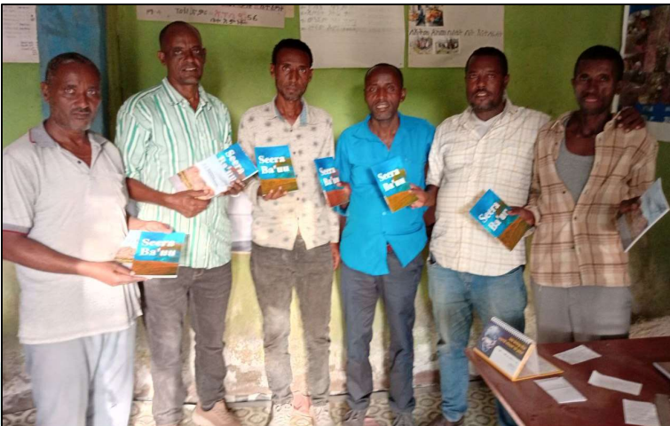
The Karama Language Committee receives their copies of Mark and Exodus