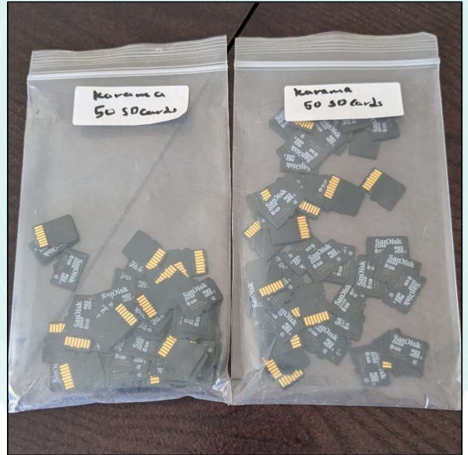
These tiny SD cards contain audio recordings of Mark and Exodus in the Karama language