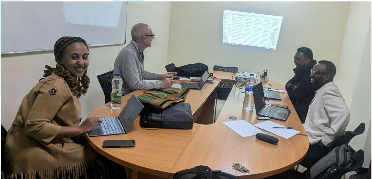
Checking the book of Luke with the Karama team. Checking started the same day that Mark and Exodus arrived for distribution!

speaks.” The Word is effective in the language people know best! Please pray that barriers to the Gospel would be removed, so that the Holy Spirit opens many hearts for Jesus in the Karama community!