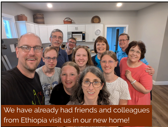
We have already had friends and colleagues from Ethiopia visit us in our new home!

We often are asked, "Are you settled?" That is a more difficult question to answer than you may think. We have unpacked the things necessary for daily living. We are using our house in all of the normal ways: preparing meals, washing laundry, sleeping, conversation, interactions, etc. We have even hung a picture on a wall! However, the idea of being settled seems so much deeper than these functions. It brings up the idea of belonging, connection and some other things. Although we are each finding our way and figuring things out a little more each day, there are moments where we miss what it was like when we lived in other places as well as times when we don't understand what is going on around us. In some ways the move back to the US is harder than a move to another country because we look and sound like Americans, but there are many cultural things that we don't understand. We are grateful for the grace extended to us by everyone.