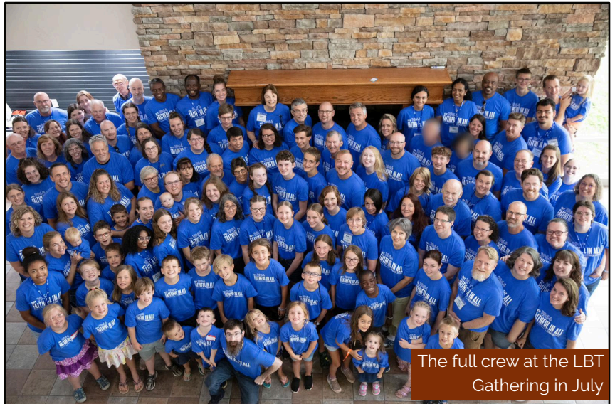
The full crew at the LBT Gathering in July