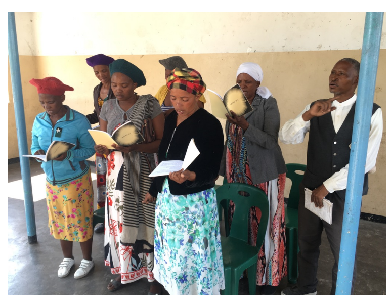
A Khwe choir singing from the book of Genesis.

As we wait for the printing to actually happen, many of the Khwe are eager to have the Bible — and they want in now . So, before we left for the States, I used app building software that is specifically designed to work with the software that we use for translation to make the Bible available on a smart phone. This has been remarkably well-received and shared in the communities. Choirs are composing songs based on the translation. People are making dramas. The Holy Spirit is working!