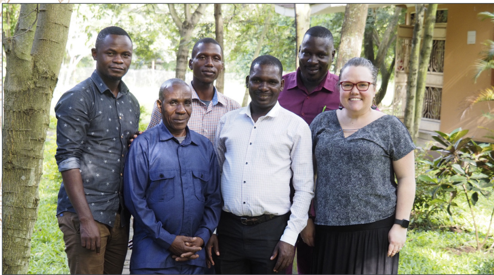
Kerewe Translation Team, Tanzania