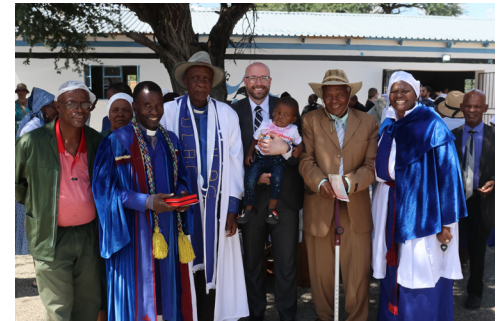
The LBT CEO joined us for the launch and everyone wanted a photo!