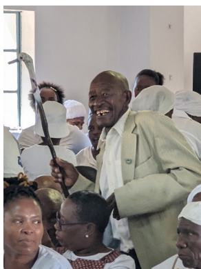
This man was so excited the whole day!