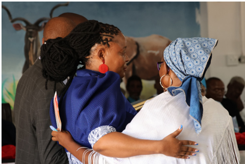
Receiving honorary Bibles for recognition in the project