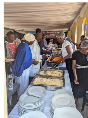
Can't have a celebration without the food!