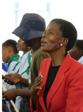
Songs and hymns were a big part of the day