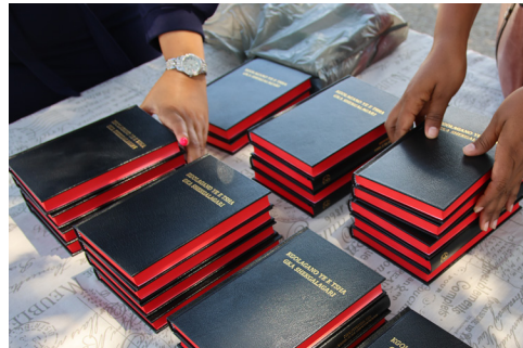
The Bibles available for sale!