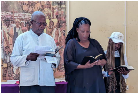
Reading from the Shekgalagari New Testament at the Lutheran Church in Kang the next day from Ephesians 2. The response from the people was incredible!