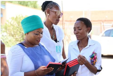
Some of the first to purchase Bibles!

On March 9, 2024, the Shekgalagari New Testament was dedicated in Kang, Botswana. A wonderful, momentous occasion marked with songs, poetry, prayers and rejoicing. We want to show you as much as we can of this great and glorious day! Your prayers and support have helped the Bakgalagari people bring God's Word to life in their language!