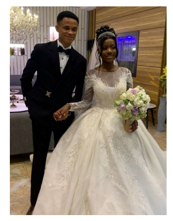
PHOTO 1: THE COURT MARRIAGE IN THE CITY PHOTO 2: THE COUPLE BEING INSTRUCTED FOR THE "MUTUAL FEEDING" PHOTO 3: AN OUTFIT FOR THE TRADITIONAL MARRIAGE PHOTO 4: AFTER THE WEDDING CEREMONY IN CHURCH