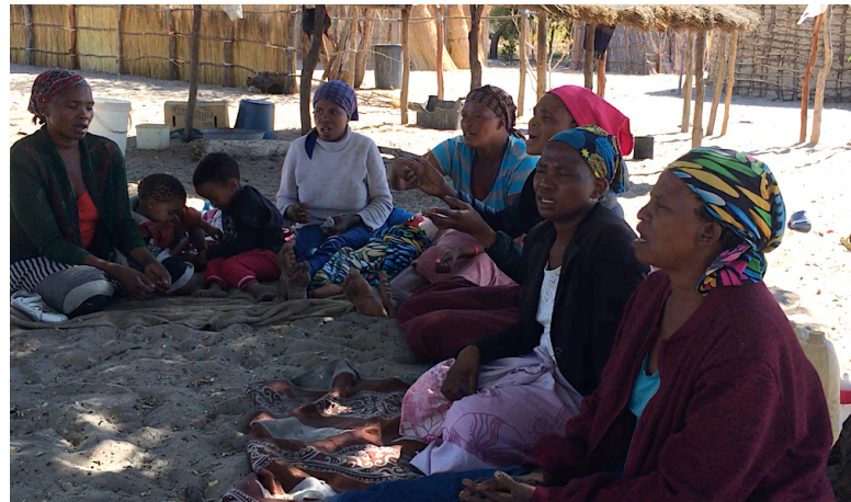
The choir singing about God's blessings

that they sang was about how richly God blesses those who love Him. Here was a group of ladies, quite impoverished, sitting on the ground, singing about how richly God has blessed them. Amazing!