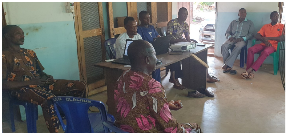
The Yala team at work. Most of the team members are looking at the draft of 1 Chronicles, which is being projected on the wall.

We were able to hold consultant checking sessions with the hard working Yala translation team in July. We went through the last third of 1 Chronicles and the first third of Leviticus. This time the team noted challenges in translating what is normally rendered as "exalted." Some questions arose: "If the Lord is exalted/lifted up, who lifted him up? And if we are to exalt/lift up the Lord, how do we do that? After some discussion, the team decided expressions that could be literally translated as, "The Lord has glory" and "Give glory to the Lord," both of which make sense in the context.