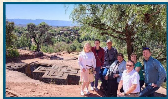
At St. George Church in Lalibella