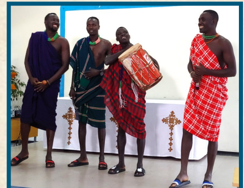
The Suri team