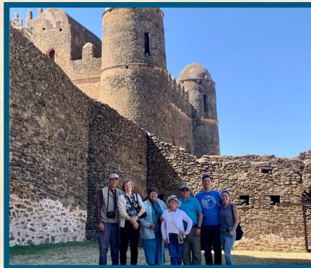
At the castles in Gondar