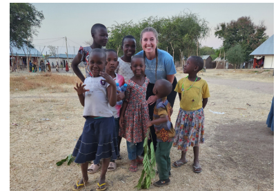
Left: My friends and I from England together again!