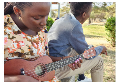
Left: Summit gathering in Dar es Salaam Right: I have really enjoyed sharing my ukulele with friends here in Mwadui!