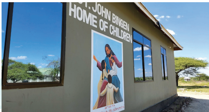
A picture of one of the dormitories on the campus of the boarding school in Mwadui.

I am looking forward to being based out of my family's home in Iowa. Between speaking opportunities, I'll get to see family and watch my sister excel in her favorite fall sport: cross country. As many of you know, I was in England last year for training, so I missed Thanksgiving and Christmas in Iowa too. It will be nice to be with family this year for these holidays.