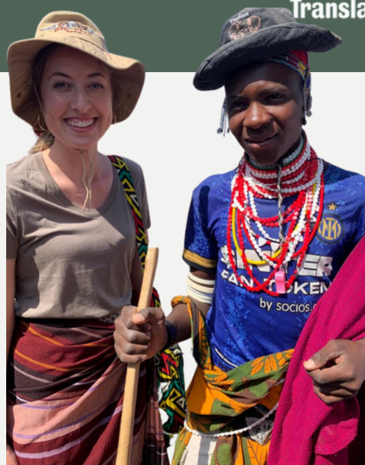
In a small village called Bukundi, I got a picture with a local, dressed very similar to the traditional Taturu men, complete with a shepherd's crook, beads, and long fabric wrapped around the torso and shoulders.

Another highlight of the trip was visiting the remote and fairly unreached villages of Bukundi and Lukale, where our Taturu language project will be taking place. In this region of the country there are many Taturu men and women living as traditional a lifestyle that they can (herding livestock and remaining pretty disconnected from the bigger cities) but that is becoming harder to do as they are confined to a specific area of the country that's environment is becoming less and less sustainable. Very dry, and very bare. Although I was a little nervous when we first pulled up in our car, walking around the village opened my eyes to the potential it has for the Bible project they are requesting. People in Tanzania, specifically this area, are hungry for God's Word! It is a great motivation for myself as I begin to plan for work and life there.