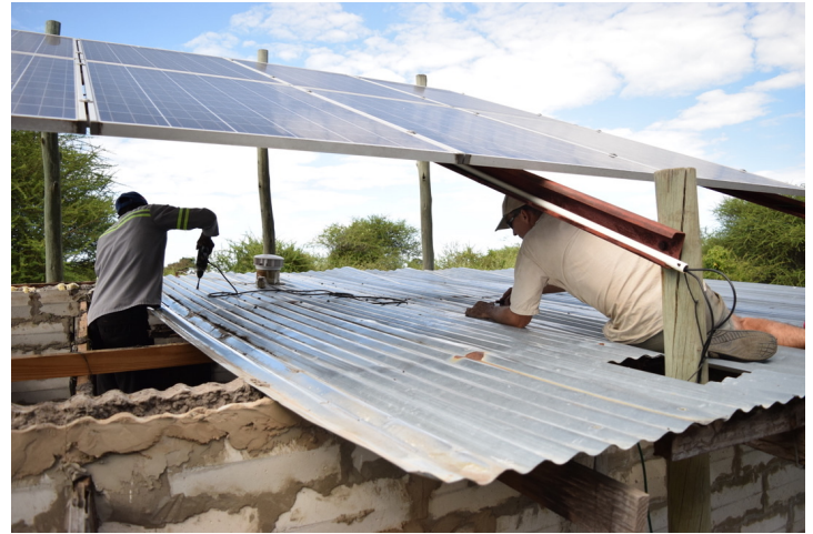
Tim and our neighbor's helper removing the roof sheets from our shed

Now we don't have to worry about a wind carrying away the roof of the shed.