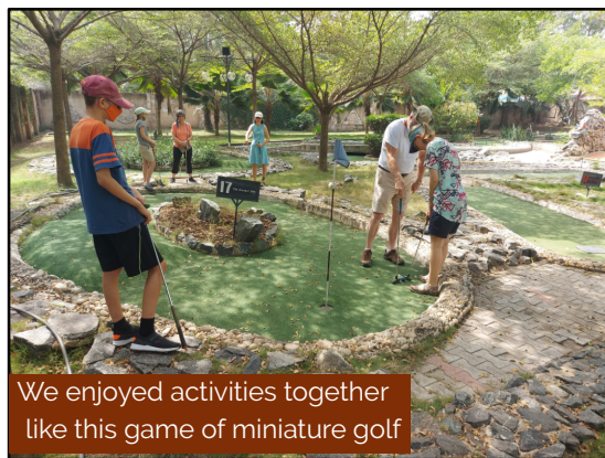
We enjoyed activities together like this game of miniature golf