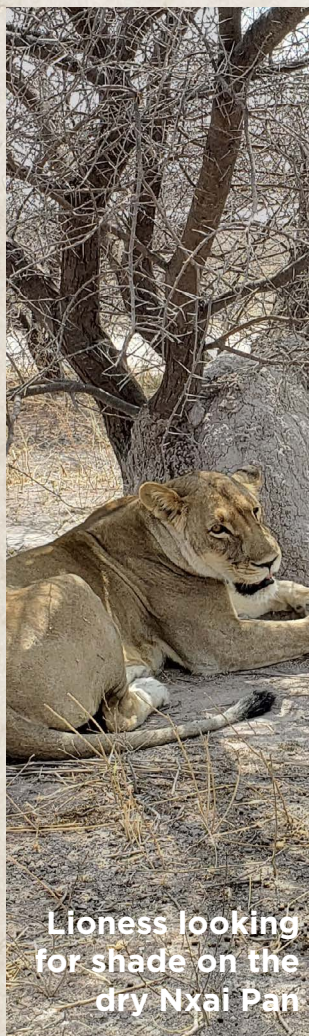
Lioness looking for shade on the dry Nxai Pan