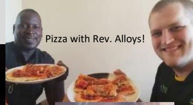
Pizza with Rev. Alloys!