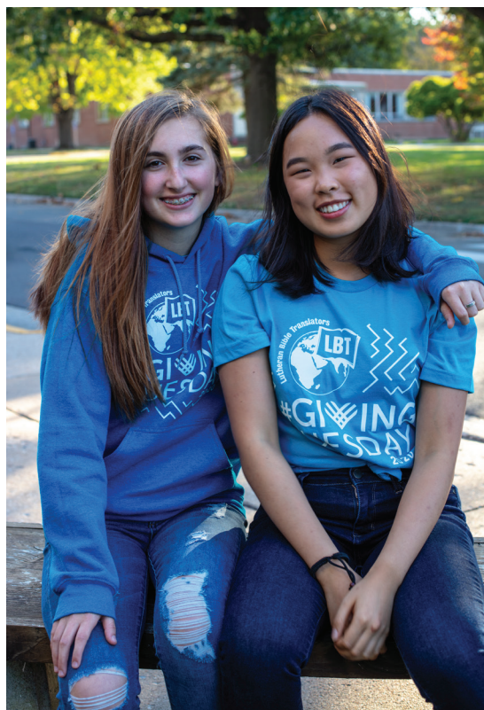
Local students in Concordia, MO, getting involved with the Bible translation movement.