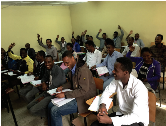
Students at the Mekane Yesus Seminary in Addis Ababa. Excited to learn about Bible translation thanks to giving efforts.