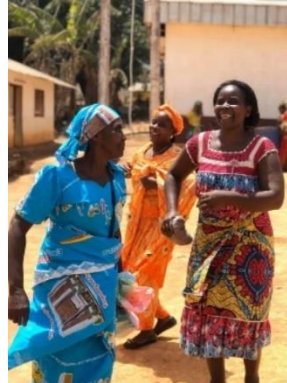
Vuté women dance and sing to celebrate the dedication of their new lectionary.

Thank you all so much for your continued prayers and support for my ministry! God's peace.