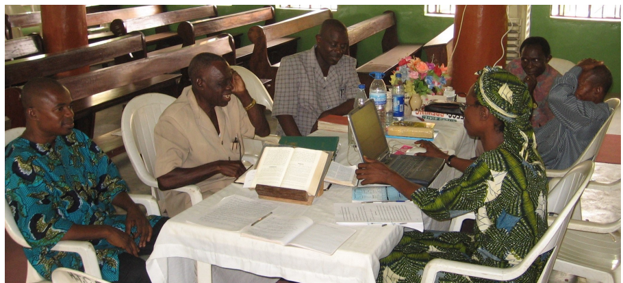
Going through Ikwerre passages